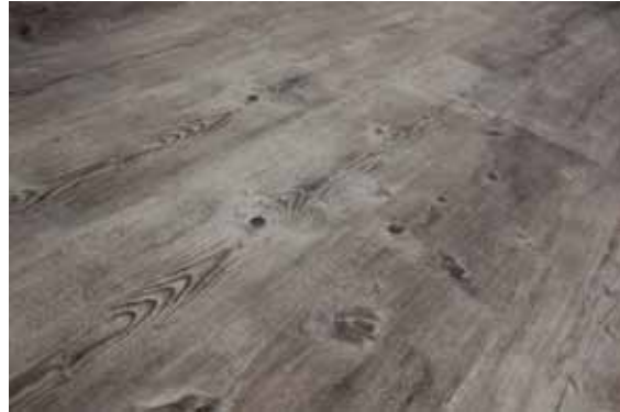
Oak Amazon Rainforest