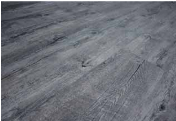
Oak Nature Grey