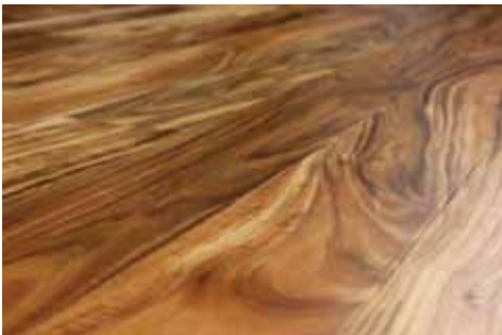
Acacia Natural Smooth