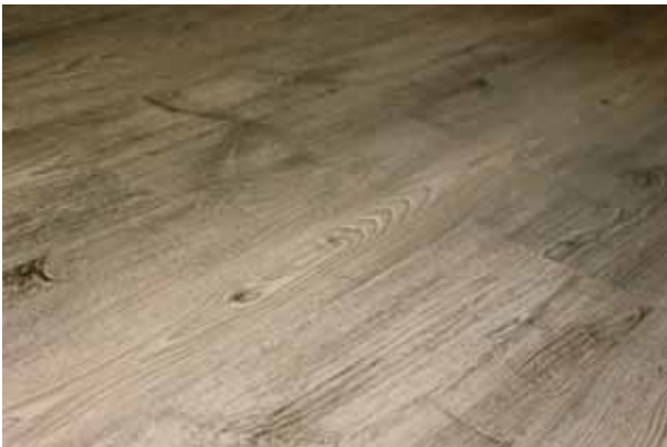
Oak Milky Way