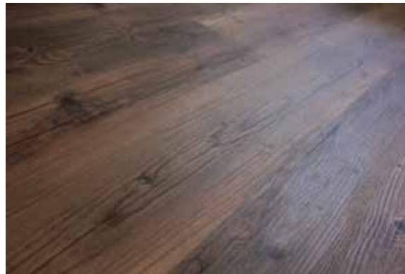
Oak Brown Bear